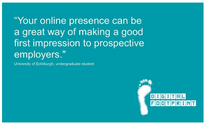
Figure 2. Quote, CC BY NC

The campaign was well received, with over 32 workshops reaching 1,000 participants; ~2,069 views of the promotional video; 5,144 visits to the website; 2,806 blog views; and a growing number of Facebook and Twitter followers. This response demonstrated a clear demand for support and advice across the University and, as a result, the Institute for Academic Development launched a mainstreamed Digital Footprint service in AY 2015-2016. Recently (late 2015), EDINA also received funding to pilot an external Digital Footprint Consultancy service building on continued external demand in this area. Both services are drawing from the research findings in order to support students and staff to better manage an effective online presence (digital footprint), and to better understand and respond to the benefits and risks of embedding social media and similar online tools into teaching and learning at the University of Edinburgh and in other HEIs and organisations.