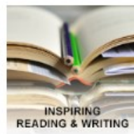
INSPIRING READING & WRITING