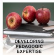
DEVELOPING PEDAGOGIC EXPERTISE